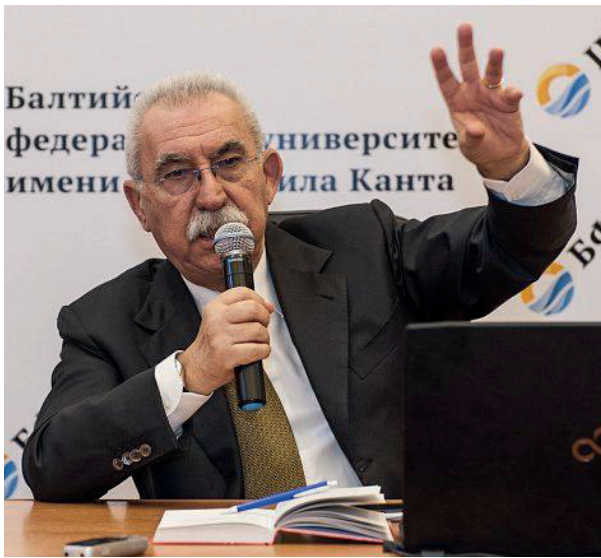
Giulietto Chiesa

Being mentioned in the report of the Lithuanian State Security Department ( Valstybės saugumo departamentas, VSD ), the Latvian Security Police ( Drošības policija, DP ) or the Estonian Internal Security Service ( Kaitsepolitseiamet, KaPo ) is a sort “mark of Cain”, after receiving which, officials can’t interact with the “unloyal” media: they can’t give them interviews and comments, nor give the accreditation to events. In addition to that, the people from the lists are also potential targets for the radical nationalists: publishing names of “enemies of the state” can be seen as a pardon from the VSD, DP or KaPo for anything they will do against the “fifth column.”