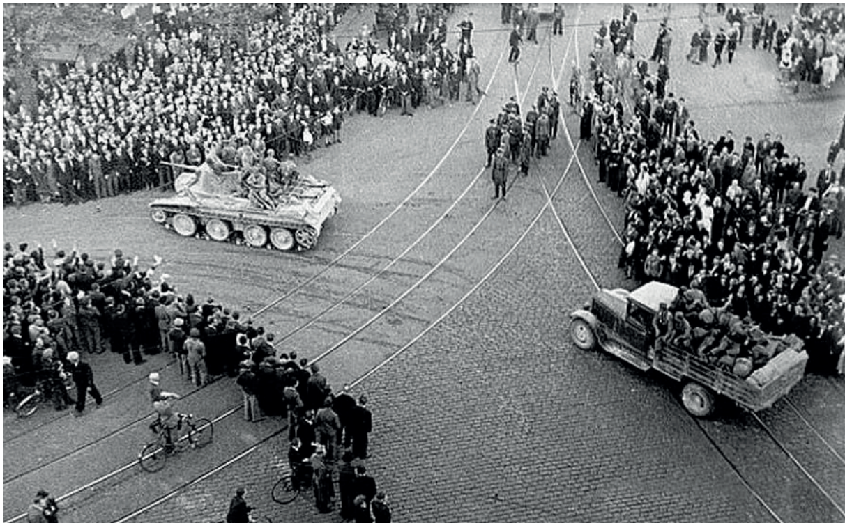
Soviet troops in Riga, 1940

Views of the Baltic countries Soviet period as "Soviet occupation" became the new nation and state building foundation for Lithuania, Latvia and Estonia after the USSR's dissolution. The occupation doctrine defined the political and economic development of these countries, served to exonerate the removal of citizenship and robbing hundreds of thousands of Latvians and Estonians of their fundamental rights, discrimi-