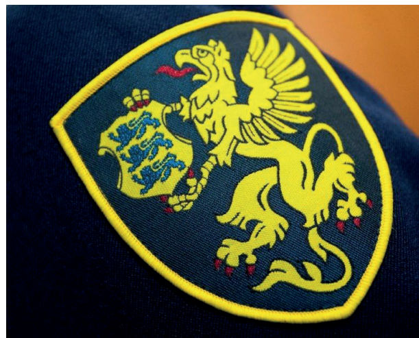
KaPo / Photo: Andres Putting