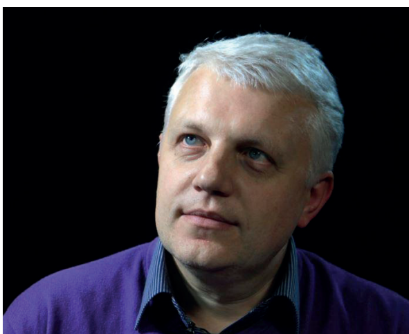
Pavel Sheremet

They have limited the broadcasts of 76 Russian TV channels (as of 12 December 2016). 16 May 2017, Ukraine banned Russian Social networks Vkontakte ( ВКонтакте ) and Classmates ( Одноклассники ), the services Yandex , Mail.Ru , ABBY and others. Ukraine has also banned 140 Russian books, with the list constantly increasing. They are currently working and discussing a law that would ban the entry of any Russian-published books into Ukraine.