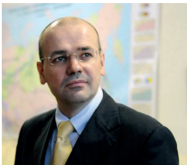
Konstantin Simonov