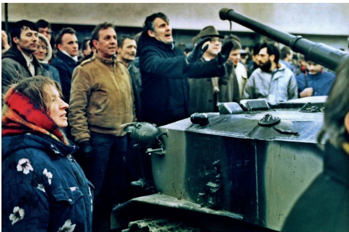
Protesters block a Soviet tank near the Press House building in Vilnius

open fire on the crowd and instead the defenders were shot by snipers on the roofs.