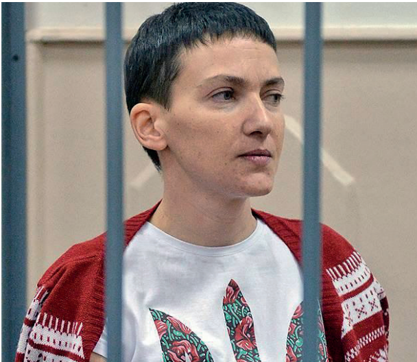
Nadezhda Savchenko

a bomb fragment in the leg, the member of the local Donetsk News Agency was also wounded. NTV and Russia Today camera crews were also under fire. 51 In the same month, an Anna News crew were shelled along with a correspondent with the Federal News Agency . In late 2016, a group of journalists was caught in a Ukrainian Army barrage in the Sakhanka village of the Novoazovsk region in the South of the self-proclaimed Donetsk People's Republic. During the attack, the conflict zone had media crew of Rossiia , NTV , Channel One , 5 Kanal as well as the LNR and DNR republican TV channels Oplot and Union . NTV correspondent Ilya Ushenin noted that the shelling began as soon as the OSCE observers left the settlement. 52