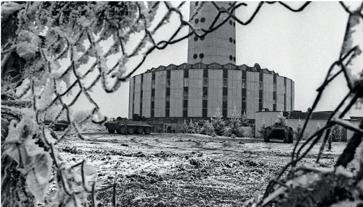
The building of the TV tower in Vilnius, 1991

PBC ran the report of the Man and Law ( Человек и закон ) program, which brought up the testimonies of the eye-witnesses who saw snipers on the roofs of the TV center, as well as words of the former commander of the Sąjūdis attack squads Audrius Butkevičius, who admitted that the crowd was shot by his men, and the decision to do this provocation and make the USSR out to be the bloody aggressor was made by the first leader of the restored Lithuanian state Vytautas Landsbergis. 4