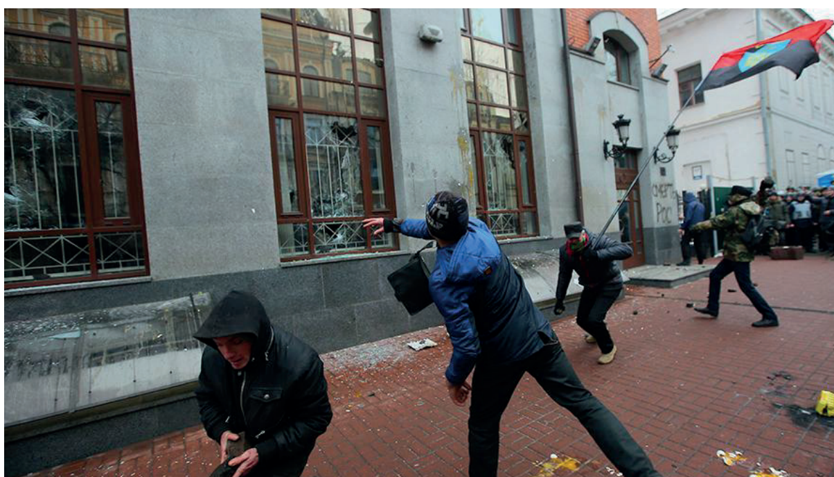
The radical right brake into the office of Rossotrudnichestvo in Kiev

fire. 22 Harlem Désir OSCE Representative on Freedom of the Media condemned these actions and called the Ukrainian government to create a safe environment for journalists.