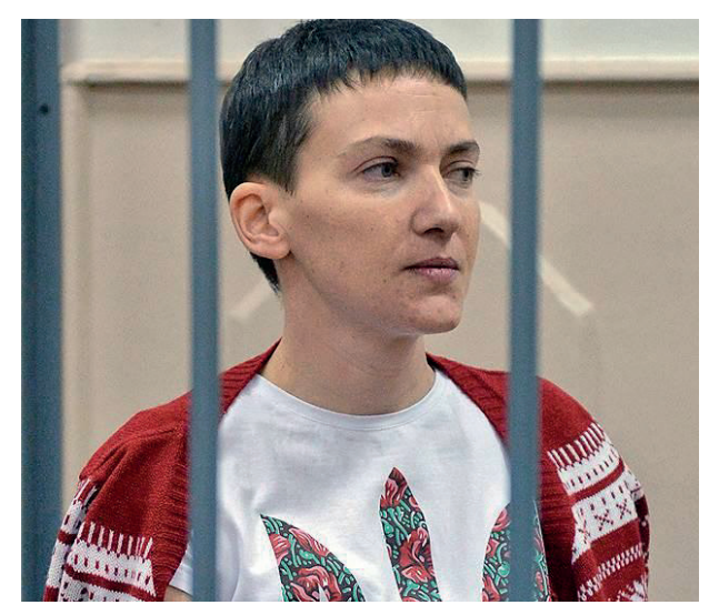
Nadezhda Savchenko