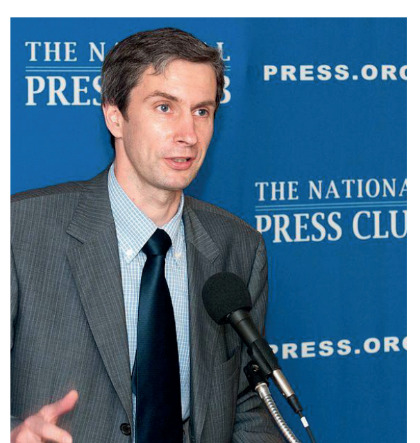
Algirdas Paleckis

In 2010, after the criminal Code was amended, the former vice-mayor of Vilnius Algirdas Paleckis got into trouble after talking about the 13 Jan-