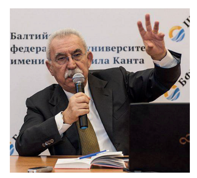
Giulietto Chiesa

Being mentioned in the report of the Lithuanian State Security Department (Valstybės saugumo departamentas, VSD), the Latvian Security Police (Drošības policija, DP) or the Estonian Internal Security Service (Kaitsepolitseiamet, KaPo) is a sort "mark of Caine", after receiving which, officials can't interact with the "unloyal" media: they can't give them interviews and comments, nor give the accreditation to events. In addition to that, the people from the lists are also potential targets for the radical nationalists: publishing names of "enemies of the state" can be seen as a pardon from the VSD, DP or KaPo for anything they will do against the "fifth column."