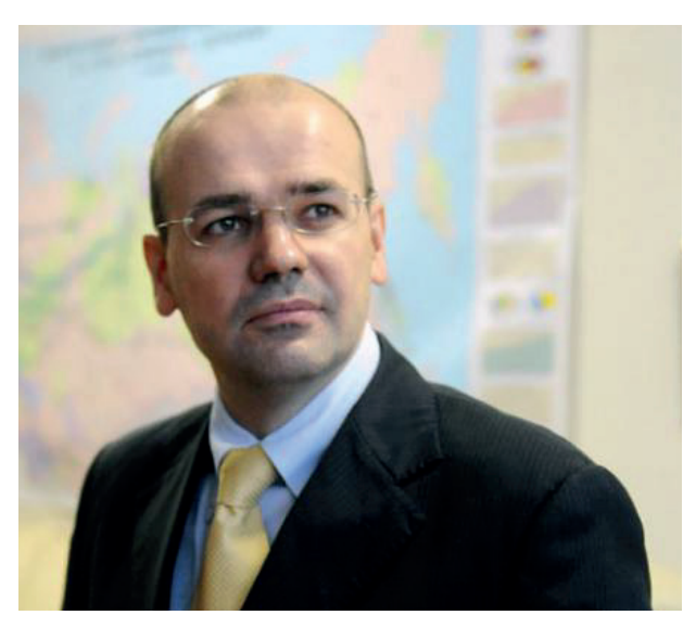
Konstantin Simonov / Photo: svpressa.ru

dissenting events, making provocations, keeping a list of opposition journalists and threaten "unloyal" media.