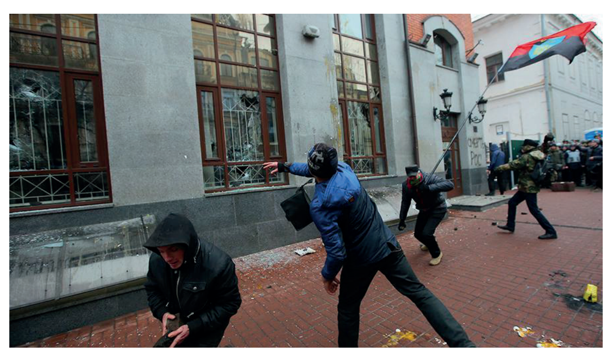
The radical right brake into the office of Rossotrudnichestvo in Kiev

fire.<sup>22</sup> Harlem Désir OSCE Representative on Freedom of the Media condemned these actions and called the Ukrainian government to create a safe environment for journalists.