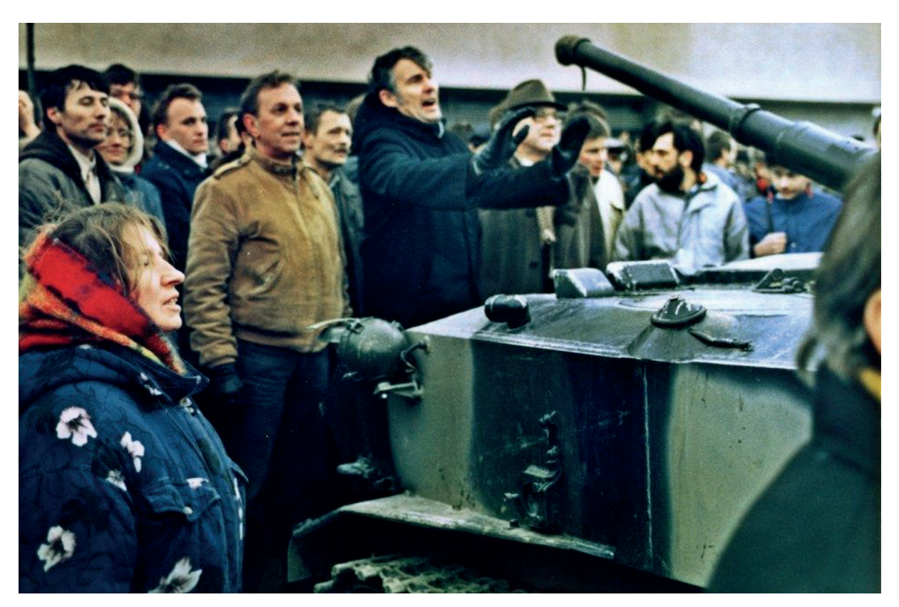
Protesters block a Soviet tank near the Press House building in Vilnius

open fire on the crowd and instead the defenders were shot by snipers on the roofs.