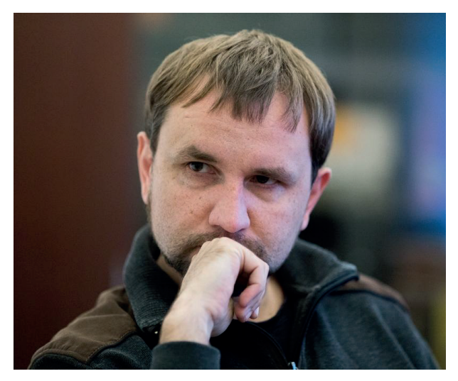
Volodymyr Viatrovych

Since 2015, there has been pressure on Ihor Huzhva, editor-in-chief of Strana . ua ( Cmpaнa.ua ) – he has been accused of evading taxes and extortion. Winter 2018, Huzhva fled Ukraine and asked for political asylum in Austria. The website continues to work and update. Searches in opposition media offices and arrests of journalists for questioning are now a common thing.