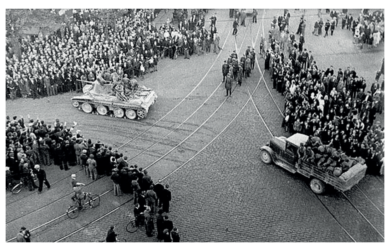
Soviet troops in Riga, 1940

Views of the Baltic countries Soviet period as "Soviet occupation" became the new nation and state building foundation for Lithuania, Latvia and Estonia after the USSR's dissolution. The occupation doctrine defined the political and economic development of these countries, served to exonerate the removal of citizenship and robbing hundreds of thousands of Latvians and Estonians of their fundamental rights, discrimi-